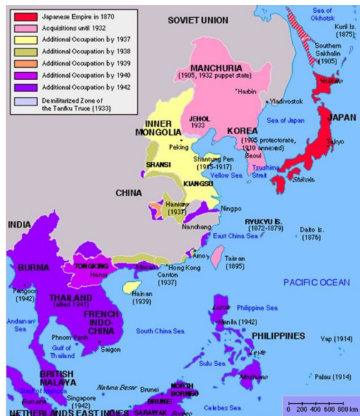
The Japanese Empire, 1870-1942

from the West—in other words, move into Hong Kong and Southeast Asia. There were other reasons that the Japanese army decided to move into French Indo-China, and then to attack the American, British and Dutch colonies—but one important reason was to outflank China, to cut off its connections with the allied powers.