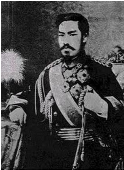
The Meiji Emperor

The ideology focused on the emperor as descended from the founding deities, as national father figure, and as the focus of the citizens' loyalty. He became the symbol of Japanese nationalism.