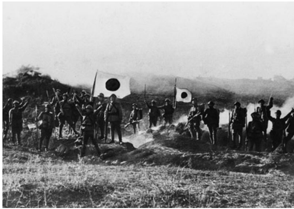
Elements of Japan's Kwantung Army blow up a railroad in the Manchurian Incident of September 18, 1931, leading to the creation of Manchukuo

1931-2, and perhaps even up until the mid-1930s, Japan's foreign policy was not significantly different from that of the US or Britain or other powers. Japan was an imperialist state that operated within the constraints of what was acceptable imperialist behavior. Only after 1931, and especially after its aggression in China in 1937, did Japan leave that framework.