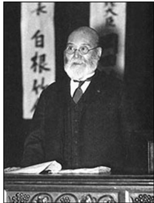
Takahashi Korekiyo. Photo taken during the 1936 election campaign, approximately one week before his assassination

empire building outside the Anglo-American framework.) Not all Japan’s leaders, and particularly not most of the army’s and navy’s leadership, agreed with this policy—that is, they still advocated a strong military and autonomy. But given the antiwar public mood of the 1920s, they acquiesced for the time.