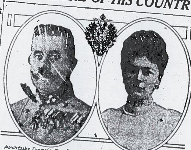
Archduke Francis Ferdinand and his Consort the Duchess of Hohenberg Slain by Assassin's Bullets.

Special Cable to THE NEW YORK TIMES. SARAJEVO, Bosnia, June 28. (By courtesy of the Vienna Neue Freie Presse.)—Archduke Francis Ferdinand, heir to the throne of Austria-Hungary, and his wife, the Duchess of Hohenberg, were shot and killed by a Bosnian student here today. The fatal shooting was the second attempt upon the lives of the couple during